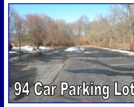
94 Car Parking Lot