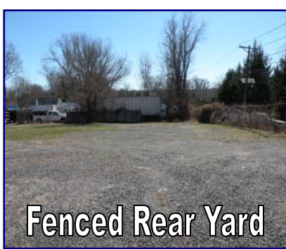
Fenced Rear Yard