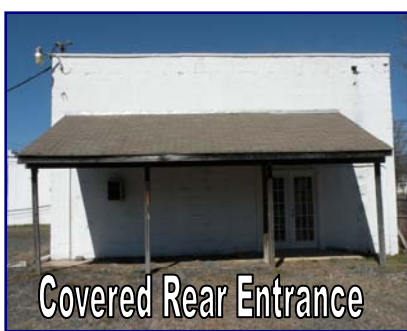
Covered Rear Entrance