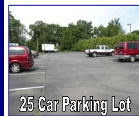
25 Car Parking Lot